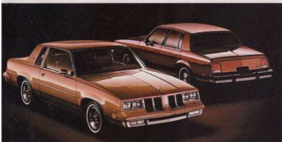
Cutlass Supreme Coupe (foreground) and Sedan.