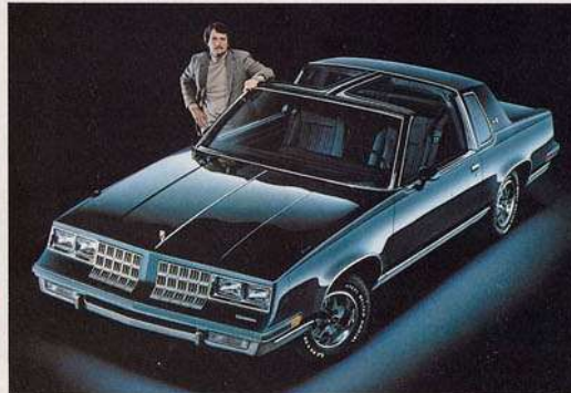
Cutlass Calais Coupe.