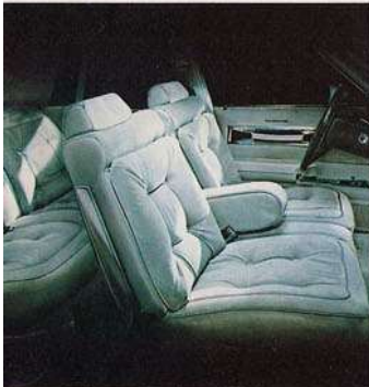
Cutlass Supreme Brougham standard interior.