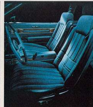
Cutlass Calais standard interior.