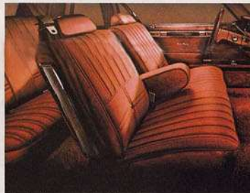
Cutlass Supreme standard interior.