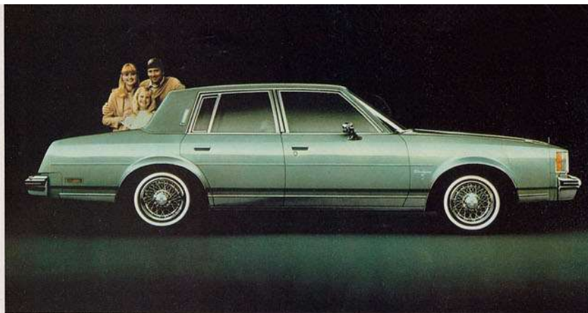
Cutlass Supreme Brougham Sedan.

Cutlass Supreme the practical, yet elegant total-value with a classic look. Take a good look at each of the new Cutlass Supreme models. Take a test drive—in the one that's right for you.